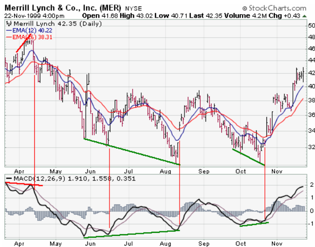
Figure 1. MACD sample in Merrill Lynch stock prices.

It can be also used indicator divergence. When the stock price is rising and MACD is falling (negative divergence), or vice versa, it can be considered a sign and can be used to predict changes within trend. That's right, the lagging indicator that is supposed to follow the price, is predicting the stock behavior.